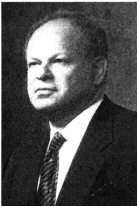
Martin E. P. Seligman